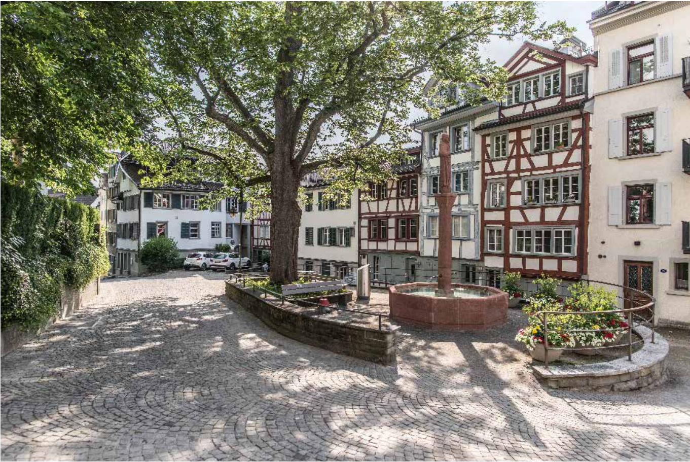
District of St.Mangen in St.Gallen