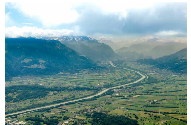
View Lake Constance, Rorschach and Rhine Valley