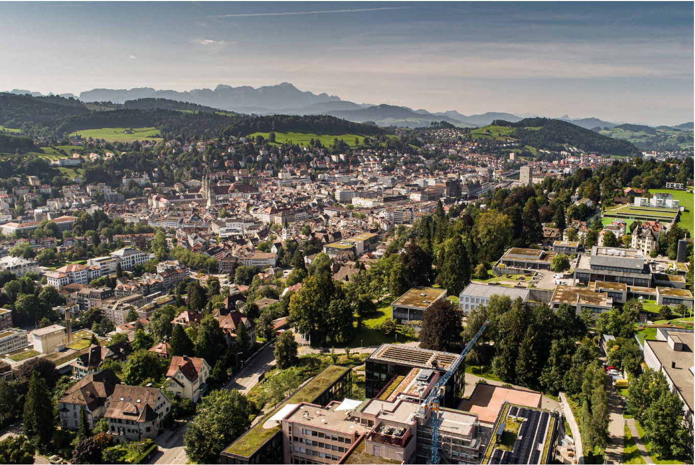
City of St.Gallen

You can also contact the conference organizing team via: tiaft@kssg.ch