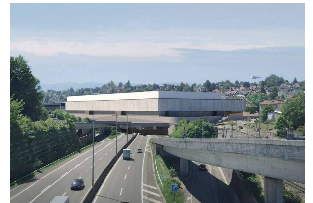
New Hall 1

Olma Messen St.Gallen is the most important meeting place in eastern Switzerland and one of the three largest exhibition locations in Switzerland. Around 90 employees ensure that around 800,000 people come together at the exhibition site every year for exhibitions, congresses and events. Olma Messen is one of the largest and most important exhibition-, event and congress organisers in Switzerland and at the same time an important part of St.Gallen's identity. With the new Hall 1, Olma Messen is expanding its premises and its range of services. The new hall will strengthen St.Gallen's position as an attractive exhibition and event venue. The opening of the new Hall 1 is planned for the first quarter of 2024 (partial opening in October 2023). Olma Messen St.Gallen creates, designs, organises and plans events on its own premises and beyond. As a partner, they offer everything from a single source. The infrastructure on the Olma grounds, provide the ideal spatial conditions.