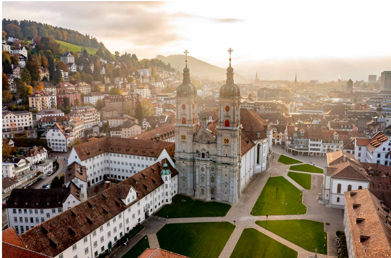
The city of St.Gallen

Let yourself be inspired by the city's traditional restaurants and hip bars. Regardless of whether you want to grab a beloved St.Galler bratwurst with Bûrli on the go or indulge in a gourmet restaurant; in St.Gallen you will find something for every taste. In St.Gallen, it is easy to get around on foot, by bike or with the well-designed public transport system. Explore the city on your own or with the help of an experienced city guide. There are many sights waiting to be discovered.